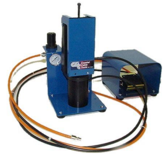
CT-4 PNEUMATIC TOOL HOLDER

Coastel Cable Tools will design custom tools or machines to meet your specific requirements. Contact us by phone, fax, email or send us a sample of the cable or wire you need stripped. We will develop a solution We can also provide solutions for your needs with any of our engineered products and equipment.