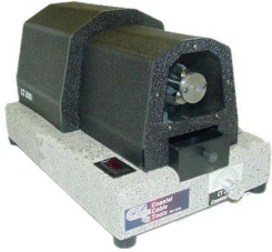
CT-200 ADJUSTABLE WIRE STRIPPER