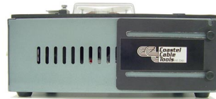
CT-7 WIRE & TUBING CUTTER