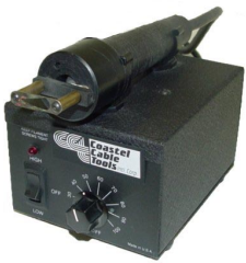
CT-100 THERMAL STRIPPER

Coastel Cable Tools will design custom tools or machines to meet your specific requirements. Contact us by phone, fax, email or send us a sample of the cable or wire you need stripped. We will develop a solution We can also provide solutions for your needs with any of our engineered products and equipment.